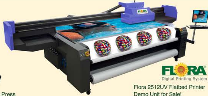
Flora 2512UV Flatbed Printer Demo Unit for Sale!