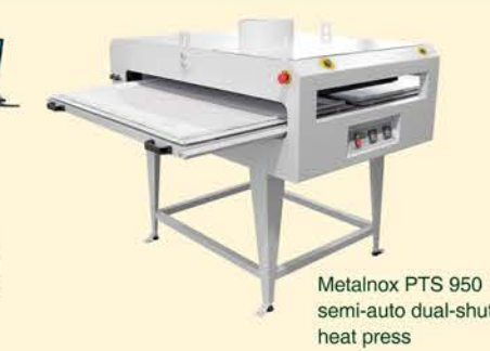
Metalnox PTS 950 semi-auto dual-shuttle heat press