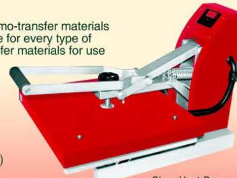
Siser Heat Press

Thinking outside the box (learn all you can personalize) Hands on with all Siser's material Be efficient on weeding and application Tip and tricks to take your business to a different level Any industry related questions will be answered