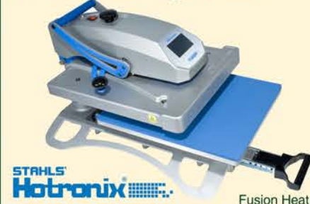
Fusion Heat Press