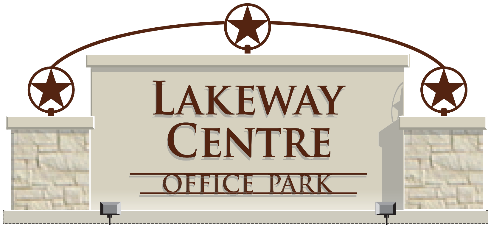
A Monument Sign • Typical Section Scale 0" = 0' For Presentation / Production